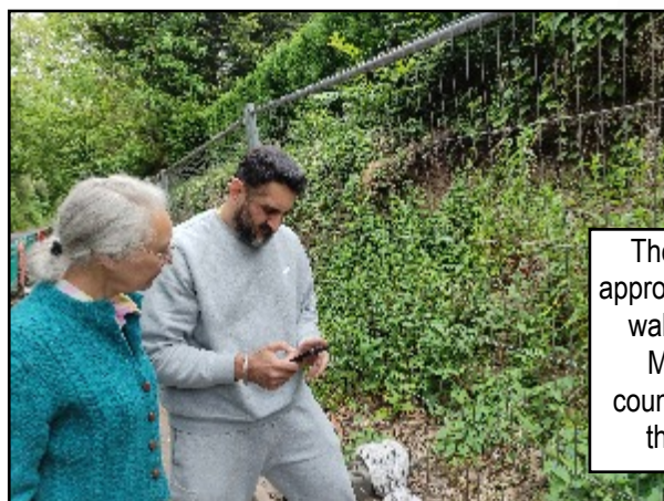
The Council Cabinet has approved funding to repair the wall by Uttoxeter Road in Mickleover. Littleover councillors are asking when this work will be done.