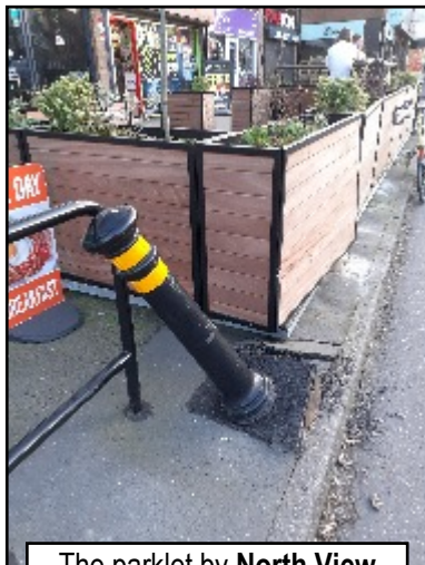
The parklet by North View was damaged by an Iceland delivery lorry. This risk has been added to the guidance for drivers.

Cllr Ajit Atwal is delighted that the clonking manhole on Burton Road near the Co-op has now been fixed. Councillors have reminded the Council that Severn Trent still need to repair the one by Constable Drive .