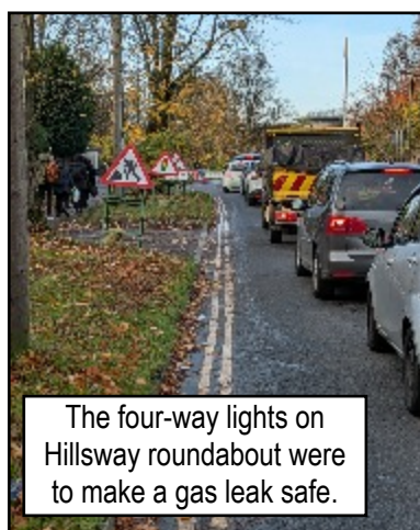
The four-way lights on Hillsway roundabout were to make a gas leak safe.

It's easy to blame the Council when cones,