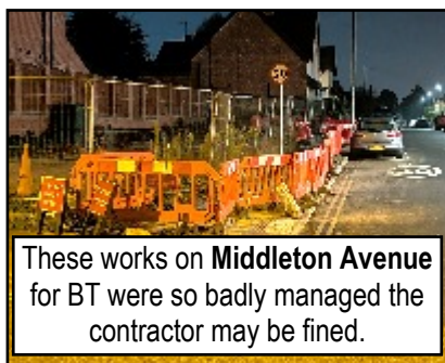
These works on Middleton Avenue for BT were so badly managed the contractor may be fined.